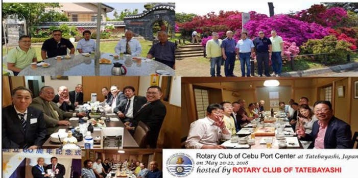
Rotary Club of Cebu Port Center at Tatebayashi, Japan on May 20-22, 2018 hosted by ROTARY CLUB OF TATEBAYASHI