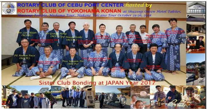
Sister Club Bonding at JAPAN Year 2017